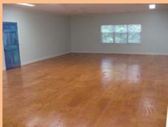
CLASSROOM 1/ Community Gallery

The Studio School recently received a much-needed facelift and renovation, making the spaces perfect for inspiring art classes. Fresh, paint, new floors, adequate lighting, and a little personality have made the classrooms warm, welcoming, and ready to be invaded by artists of all ages!