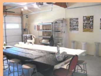
CLASSROOM 4/ Ceramics Studio