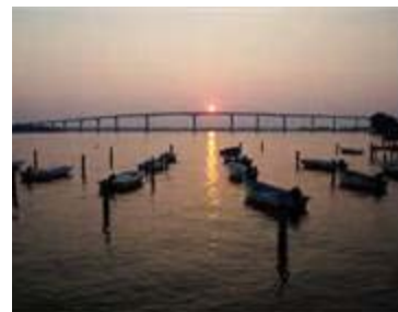
Exhibit Eligibility & Details

Annmarie Sculpture Garden & Arts Center is located in Solomons, a lovely waterfront town situated where the Patuxent River meets the Chesapeake Bay. Just over an hour drive from the Washington DC-Baltimore metro area, Solomons is a popular destination for tourists, boaters, and regional residents. With spectacular views, interesting shops, a terrific marine museum, and wonderful restaurants, Solomons is a delightful place to spend a day or weekend. This distinctive setting and engaging array of programs and exhibits makes Annmarie an important element of any visit to the Solomons area.