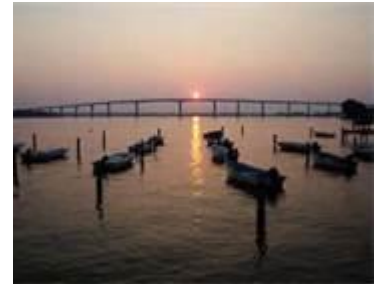
Exhibit Eligibility & Details

Annmarie Sculpture Garden & Arts Center is located in Solomons, a lovely waterfront town situated where the Patuxent River meets the Chesapeake Bay. Just over an hour drive from the Washington DC-Baltimore metro area, Solomons is a popular destination for tourists, boaters, and regional residents. With spectacular views, interesting shops, a terrific marine museum, and wonderful restaurants, Solomons is a delightful place to spend a day or weekend. This distinctive setting and engaging array of programs and exhibits makes Annmarie an important element of any visit to the Solomons area.