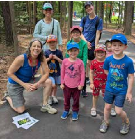
Family Nature Walks 48 Families

Anmarie brings people of all ages together through nature-based programs that spark curiosity. While signature events like Fairy & Gnome Home Festival , Mud Day , and Insectival continue to anchor this work, we also offer more intimate, hands-on experiences that deepen engagement with our natural world. Programs such as Family Nature Walks, Hester's Houseplant Prop & Swap, and our Holiday Wreathmaking Party invite participants to engage with nature in creative and artful ways.