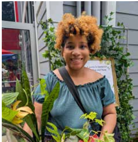
Houseplant Prop & Swap 35 Guests