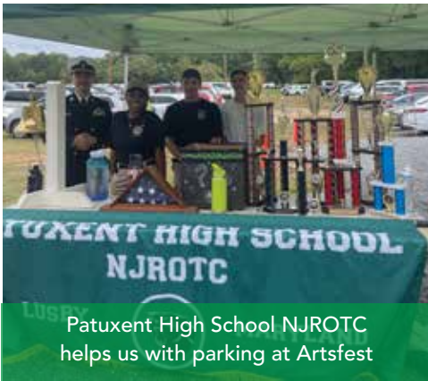
Patuxent High School NJROTC helps us with parking at Artsfest