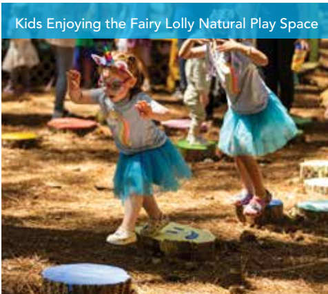
Kids Enjoying the Fairy Lolly Natural Play Space