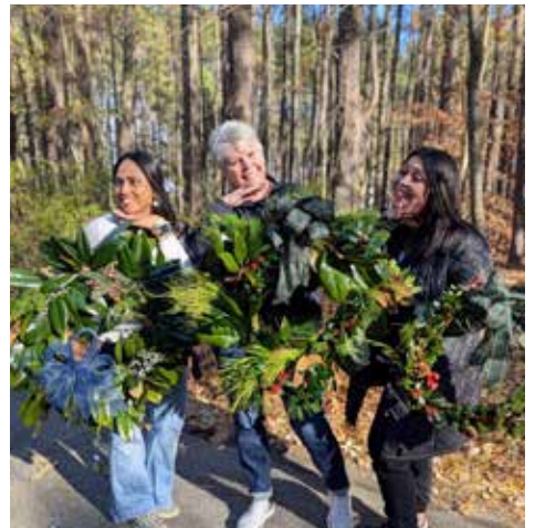
Holiday Wreathmaking Party 79 Guests