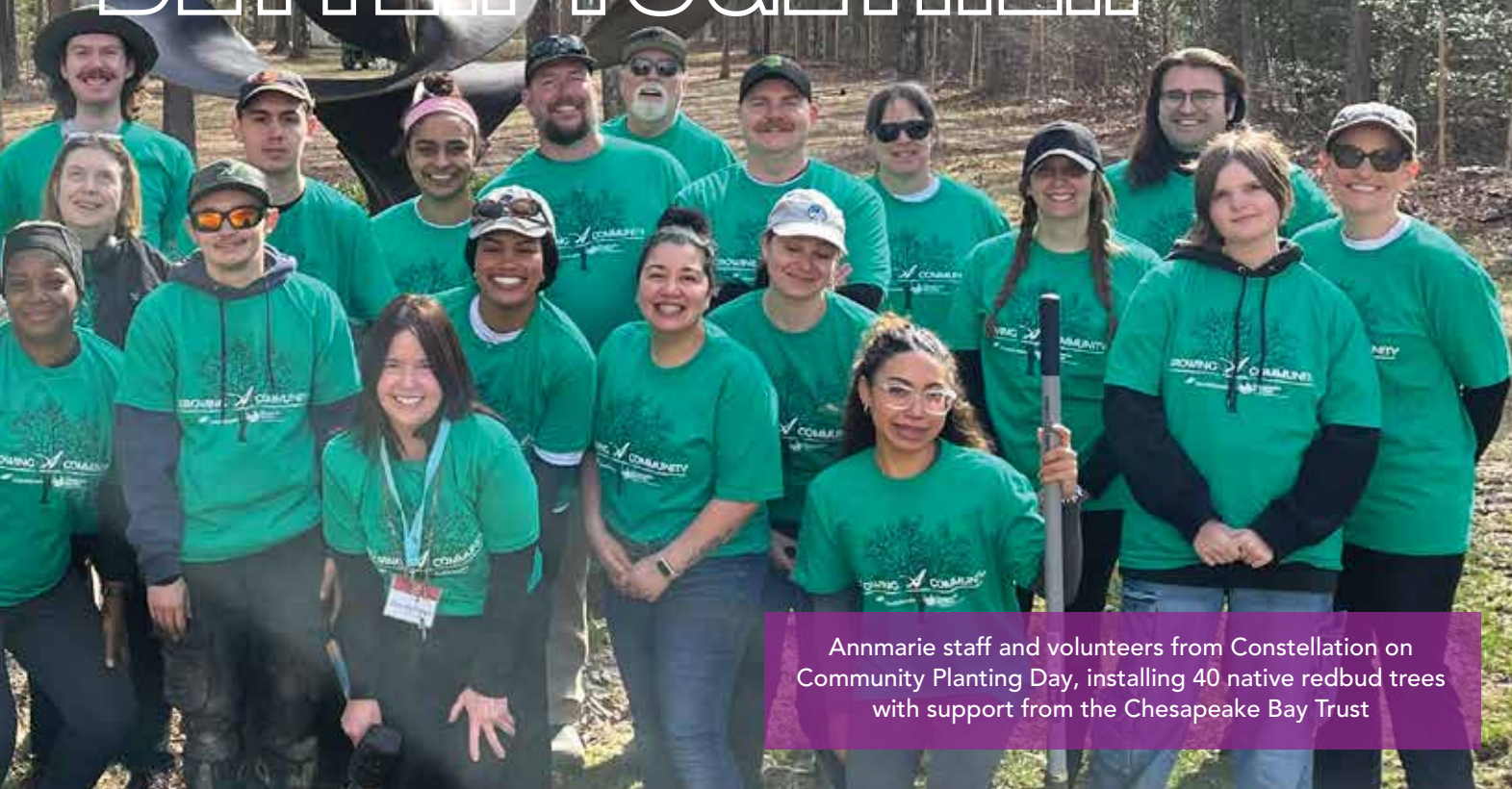
Annmarie staff and volunteers from Constellation on Community Planting Day, installing 40 native redbud trees with support from the Chesapeake Bay Trust