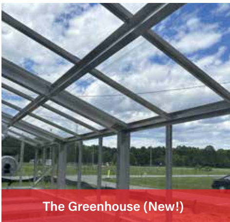
The Greenhouse (New!)