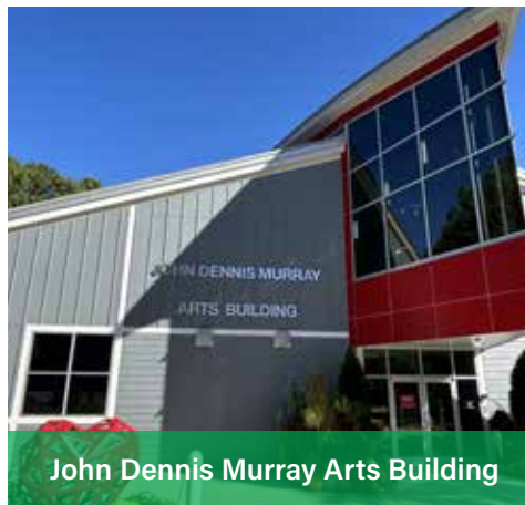
John Dennis Murray Arts Building