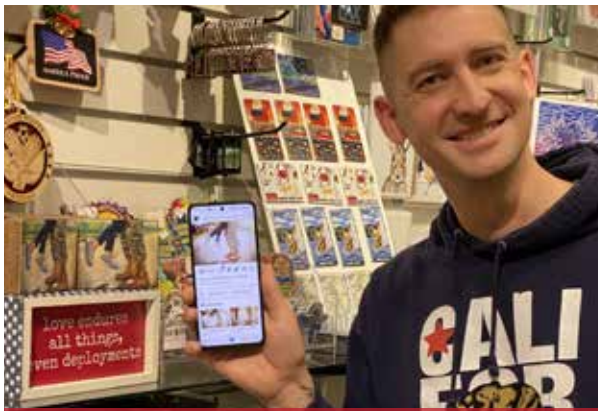
A visitor discovered his feet had been used as the model for one of our gift shop items—a fun and unexpected moment!