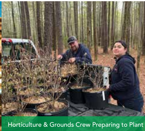
Horticulture & Grounds Crew Preparing to Plant