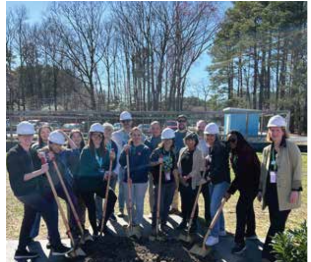
The Annmariе Team at the Greenhouse Groundbreaking Ceremony; March 18, 2025

In FY25, Annmariе Sculpture Garden & Arts Center advanced its commitment to environmental education and community engagement through the development of a new greenhouse adjacent to the Community Garden. Supported by key grant funding from the State of Maryland's FY23 Legislative Bond Initiative, the Rural Maryland Council, and the Cove Point Natural Heritage Trust, and in partnership with the Calvert County Master Gardeners, this project will serve both operational and educational purposes. The greenhouse will support horticultural needs across campus while also functioning as a hands-on learning space for youth and community programs focused on native plants, sustainability, and the nutritional benefits of home gardening.