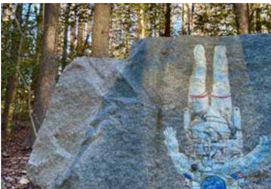
Modern Petroglyphs; Kevin Sudeith