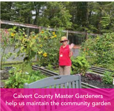
Calvert County Master Gardeners help us maintain the community garden