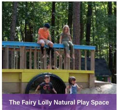
The Fairy Lolly Natural Play Space