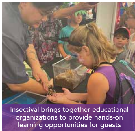
Insectival brings together educational organizations to provide hands-on learning opportunities for guests