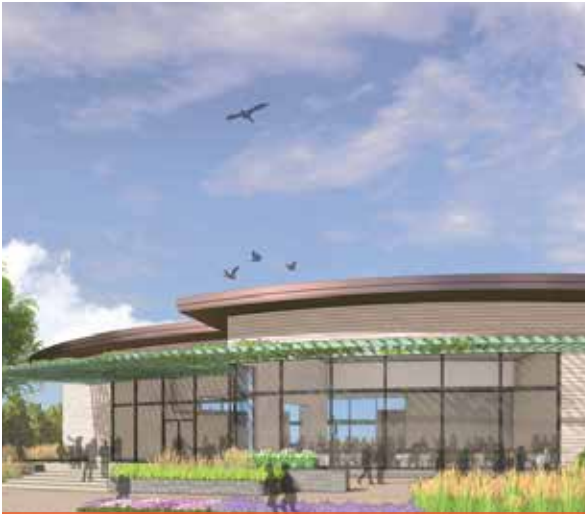
Rendering of Waterfront Welcome Center, part of Annmariе's Long Range Expansion Plan

In FY25, Annmariе Sculpture Garden & Arts Center began early steps in advancing its Long-Range Expansion Plan, approved by both boards in June 2024 following extensive research, community input, and strategic planning. The Plan outlines a bold, phased vision for a larger, ecologically sensitive art and nature campus that builds on Annmariе's unique setting along the Chesapeake Bay while preserving the beauty of its existing gardens, woodlands, and sculpture collection. Designed to enhance cultural, educational, and community opportunities for Southern Maryland and beyond, this long-term initiative reflects Annmariе's continued commitment to thoughtful growth, sustainability, and meaningful visitor experiences.