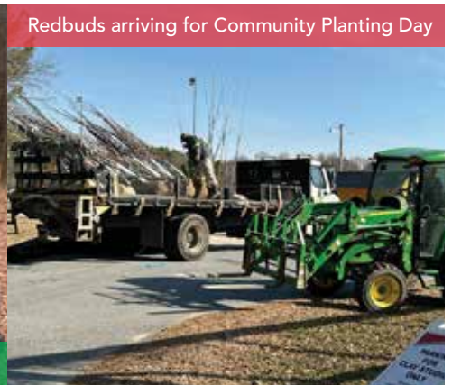
Redbuds arriving for Community Planting Day