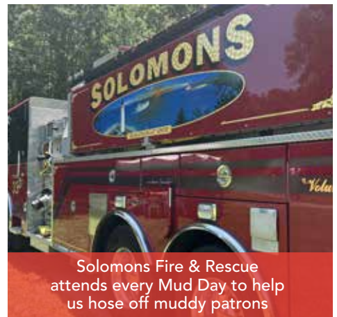
Solomons Fire & Rescue attends every Mud Day to help us hose off muddy patrons